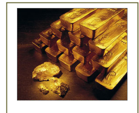
Gold Bars and nuggets

"We stand to make as much or better and sleep at night instead of going to jail," he said